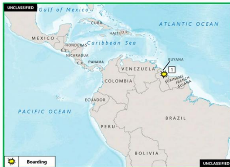
(U) Figure 1. Piracy and Armed Robbery at Sea in South America