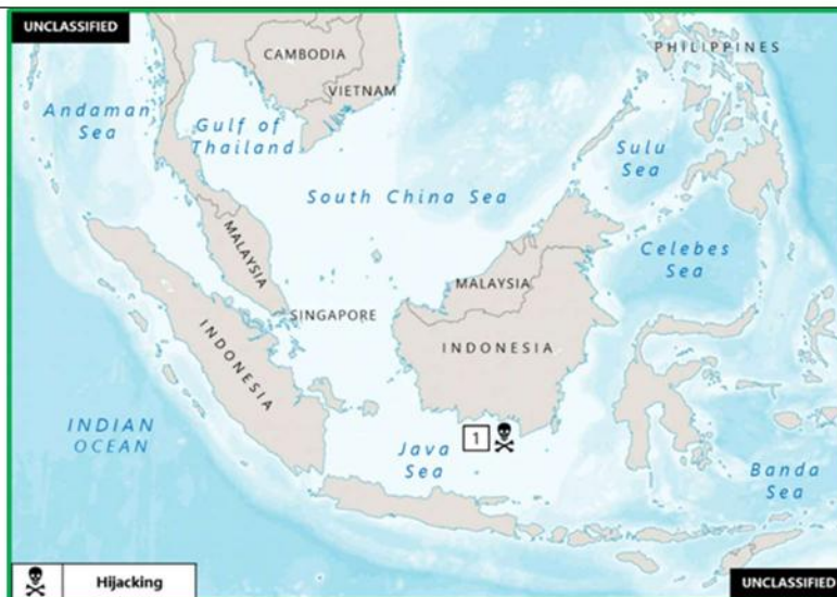
(U) Figure 3. Piracy and Armed Robbery at Sea in Southeast Asia