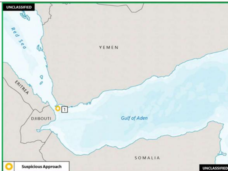
(U) Figure 2. Suspicious Approach in the Gulf of Aden