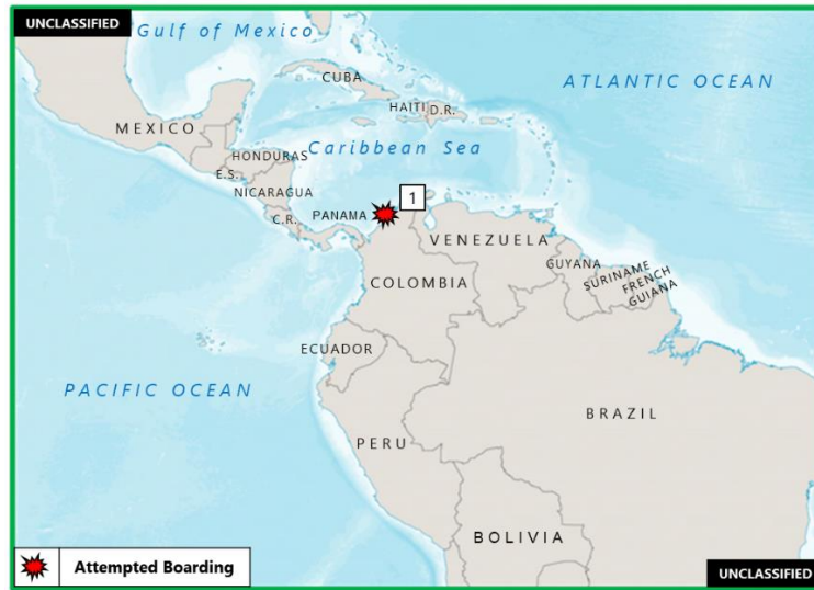
(U) Figure 1: South America Piracy and Armed Robbers at Sea

1. (U) COLOMBIA: On 28 August at 0130 local time, one perpetrator attempted to board an anchored Denmark-flagged LPG tanker at Cartagena Inner Anchorage, near position 10:19N – 075:32W. The duty crew observed four perpetrators in a boat near the anchor chain and another in the hawsepipe. The officer on watch was alerted to the presence of the perpetrators and the fire pumps were activated. Seeing the crew's alertness, the perpetrators escaped. The vessel notified port control and the coast guard investigated the area around the tanker. (Clearwater Dynamics; IMB)