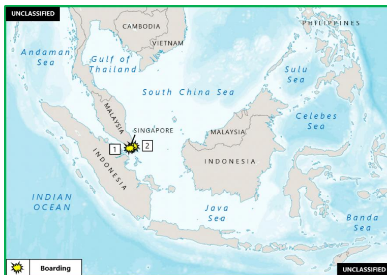
(U) Figure 3. Southeast Asia Piracy and Armed Robbery at Sea